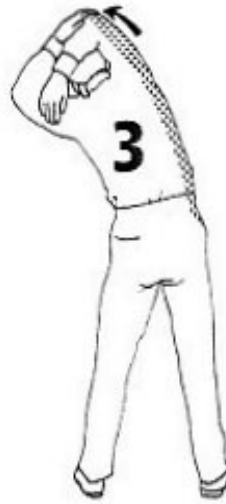
8-10 seconds each side