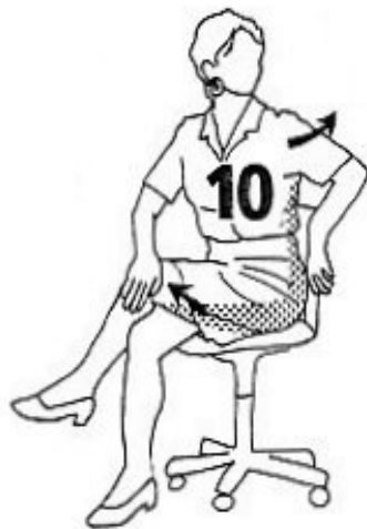
8-10 seconds each side