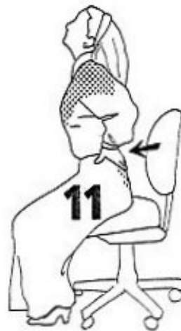
10-15 seconds 2 times