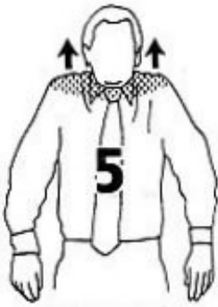
3-5 seconds 3 times