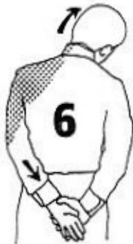
10-12 seconds each arm