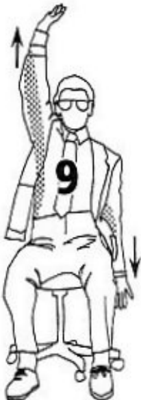
8-10 seconds each side