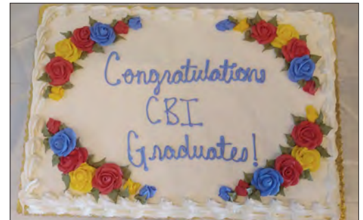
A sweet tribute to CBI graduates.