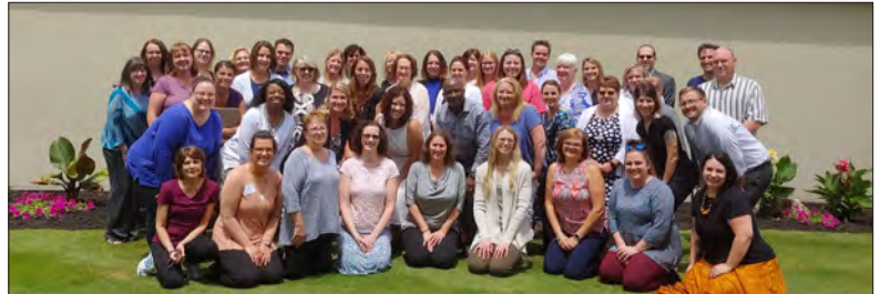
Members of the Capacity Building Institute Spring Class of 2018 are pictured (not all participants are shown).

“The knowledge gained from the sessions was expansive and served to enhance the depth and breadth of my skills with regards to supporting a population in need of thoughtful and intentional supports to sustain positive