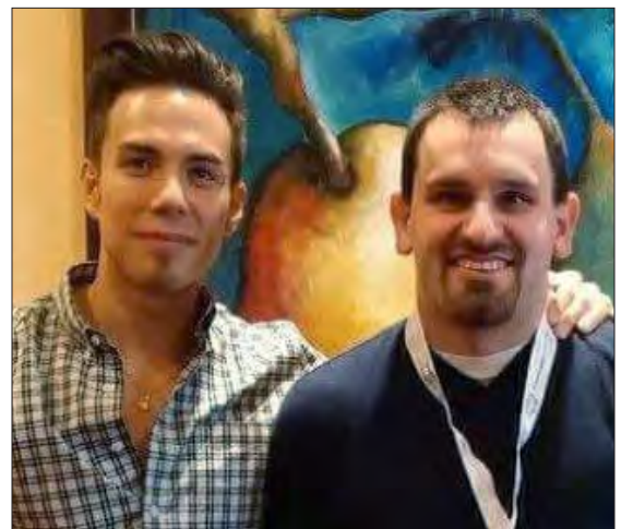
Derek got to meet Olympian speed skater Apolo Ohno.